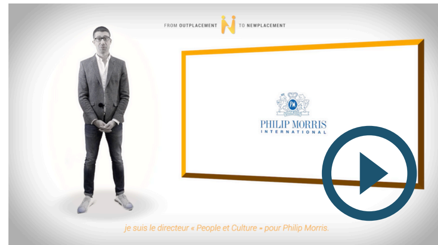
je suis le directeur « People et Culture » pour Philip Morris.